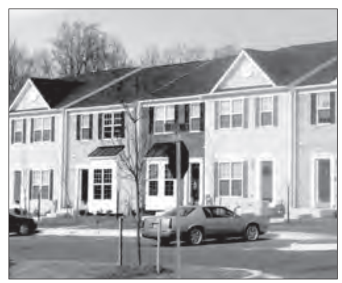
Hamlin Park townhouses