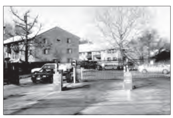
Maple Ridge apartments

area is proportionally divided into three types: single-family detached, townhouses, and apartments. Many of the single-family detached houses were built in the early twentieth century. In addition, there are pockets of new infill developments throughout the area, such as the Hamlin Park townhouse community.