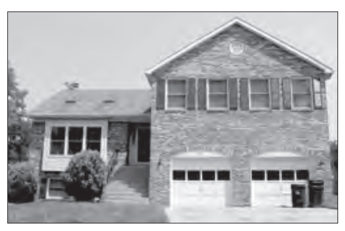
Single-family detached housing